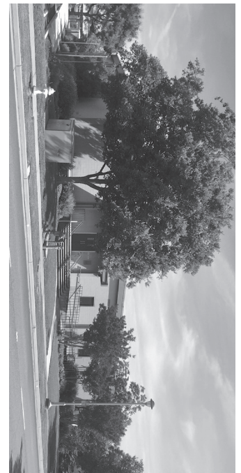
10541 Norden Avenue • Mather, CA 95655