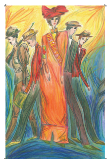
World War I