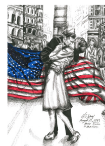
World War II