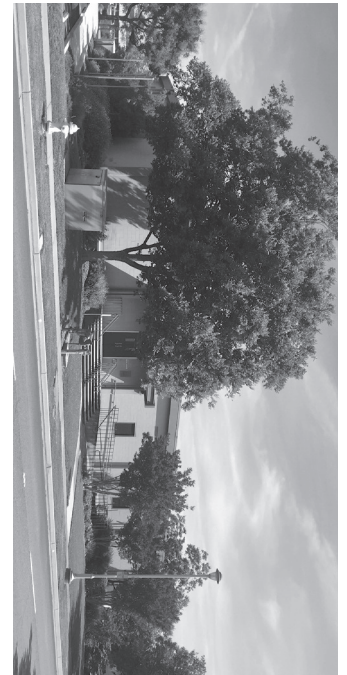
10541 Norden Avenue • Mather, CA 95655