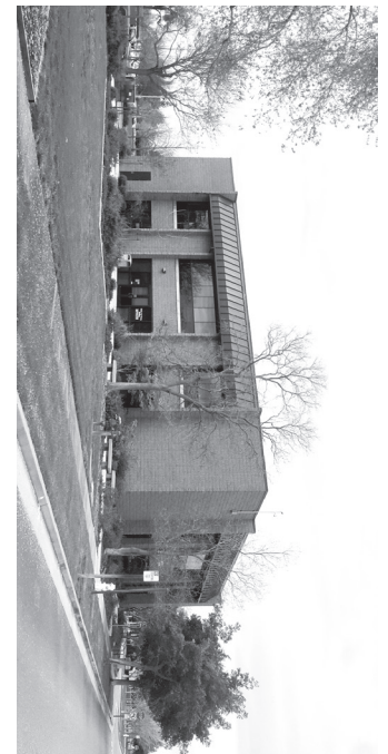
10530 Mather Boulevard • Mather, CA 95655