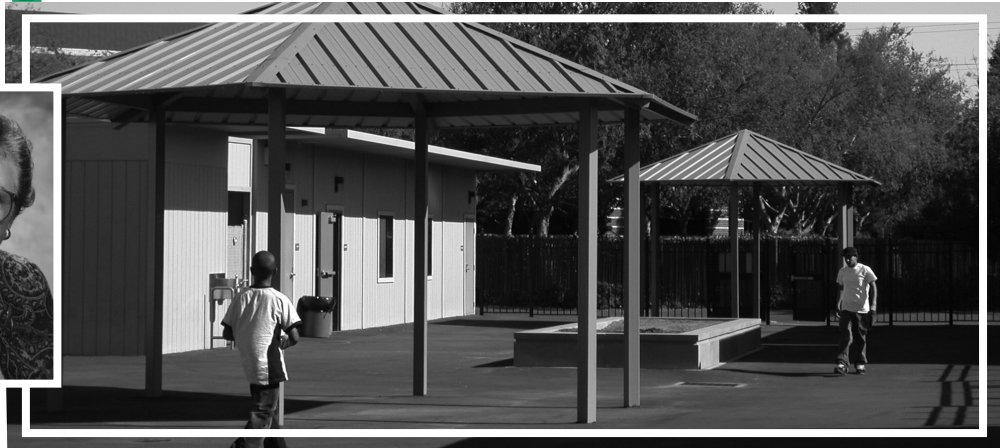
Elinor Lincoln Hickey Junior-Senior High School - Sacramento, California

Please join the Sacramento County Board of Education For a Ceremony to Formally Dedicate the ELINOR LINCOLN HICKEY JUNIOR-SENIOR HIGH SCHOOL A Sacramento County Office of Education Campus